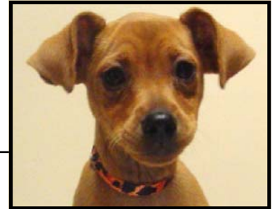
Mocha the min pin walks every day!

Windsor Essex County Health Unit Attn: Karen Lukic 360 Fairview Ave. W Suite. 215 Essex, ON N8M 3G4