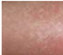
Lace-like rash of the leg.