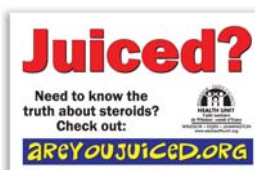
Approximate size of folded wallet card: 2" x 3.5"

Lists side effects of use, informative websites, as well as how to "Bulk Up" the healthy way! The optional mini contract for student/coach can be used to enhance discussion.